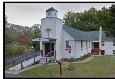
Magothy/Chelsea Community Lutheran Church

Did you know the community meets each quarter to discuss changes in our community, answer questions/concerns, provide updates, etc.? We do! Every 3-months in the basement of Magothy/Chelsea Community Lutheran Church on 265 Beach Ave. The next meeting will be held Wednesday, December 2nd at 6:30PM. All residents are welcomed/encouraged to attend!