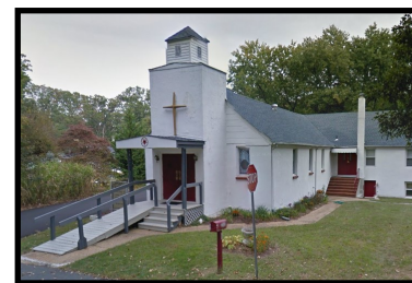
Magothy/Chelsea Community Lutheran Church